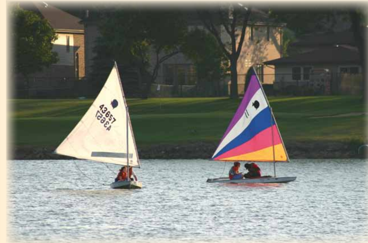
Sailing on Lake Opeka