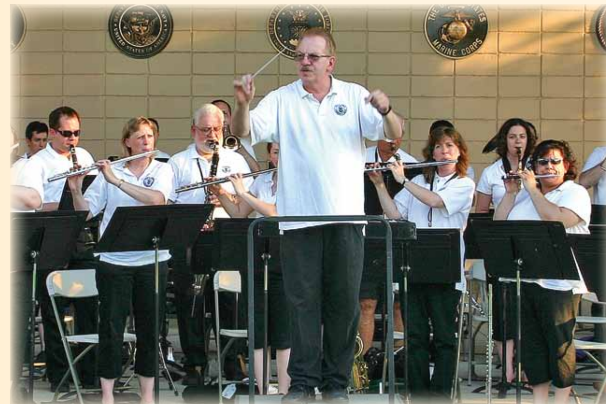
Summer Concerts in the Park