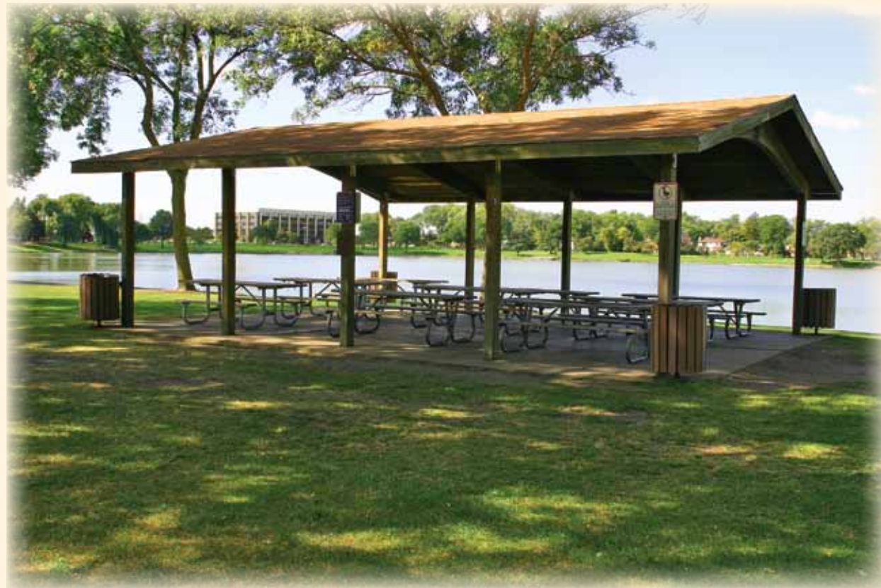
SOUTH PICNIC SHELTER DONATED BY THE OPTIMIST CLUB OF DES PLAINES

Lake Park includes a number of beautiful areas that are enjoyed year-round by everyone in Des Plaines.